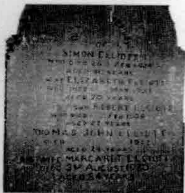
Grave in Manorhamilton